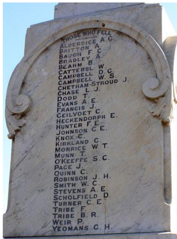
Walgett Soldiers' War Memorial