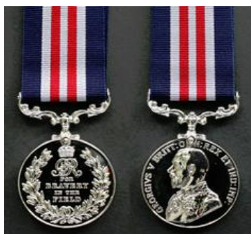
Military Medal showing both sides